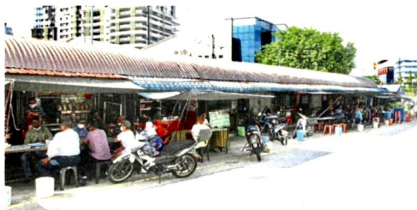
The hawkers along Jalan 13/4 in Petaling Jaya are reluctant to move due to high rentals and uncertain business elsewhere.

He highlighted that the hawkers were given several options for relocation, namely Pasar Besar Jalan Othman, Kompleks C in Jalan Sultan and PJ Midtown in Section 13.