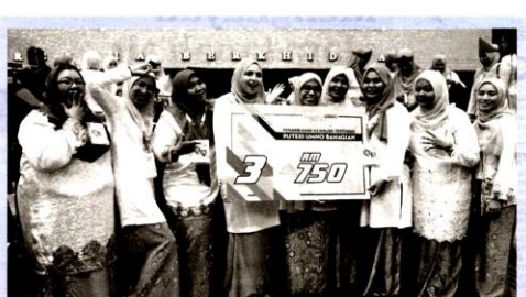
PUTERI UMNO Kuantan mendapat tempat ketiga bagi Persembahan Kualiti Terunggai Puteri UMNO Bahagian di seluruh negara, tahun lalu.

UMNO menggunakan gencatan politik, howsep? Satu tindakan yang tepat pada masanya. Gencatan politik ini secara tidak langsung membolehkan UMNO adalah sebuah parti politik yang berjaya besar, matang dan meluaskan