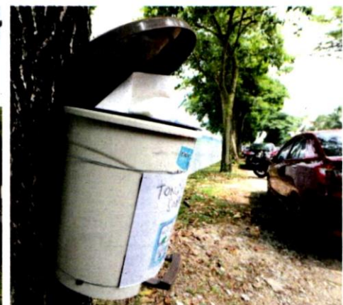
This makeshift rubbish bin is one of the LRT3 project contractor's efforts to keep the surrounding residential area clean.