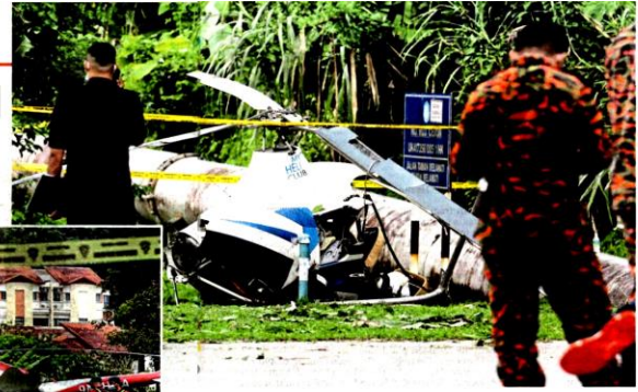
The wreckage of the blue helicopter at the crash site in Taman Melawati, Ampang, yesterday. (Inset) Investigators checking the red helicopter at the field in SJKT Taman Melawati.

Bernama quoted a Transport Ministry source as saying that