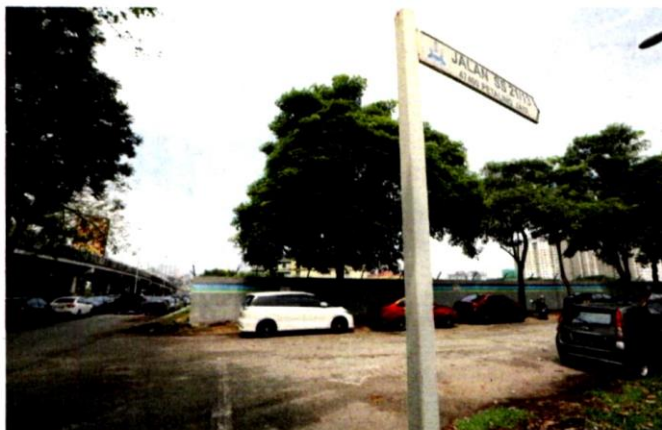
Parked cars line the sides of a few roads in SS21. Residents say they belong to workers from the LRT3 project in the vicinity.