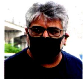
Savinderjeet says the workers also drive at high speeds within the neighbourhood.

They say project workers causing obstruction along several roads in SS21 neighbourhood