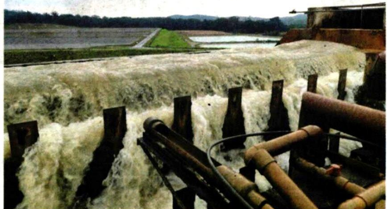
LRA Sungai Linggi di Seremban beroperasi semula semalam selepas kerja-kerja pembaikan tebing Sungai Linggi berjaya dilaksanakan.

Menurutnya, Sains akan memastikan seluruh kawasan gangguan di Port Dickson dan Seremban akan mendapat bekalan air terawat seawat-lewatnya Rabu ini secara berperingkat bergantung kepada kerja-